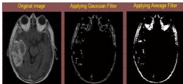
Fig.1 Original Image