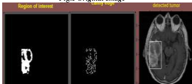
Fig.2 Detection result